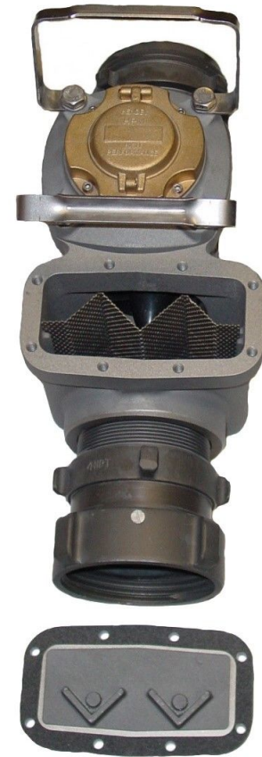
Large Built-in Strainer