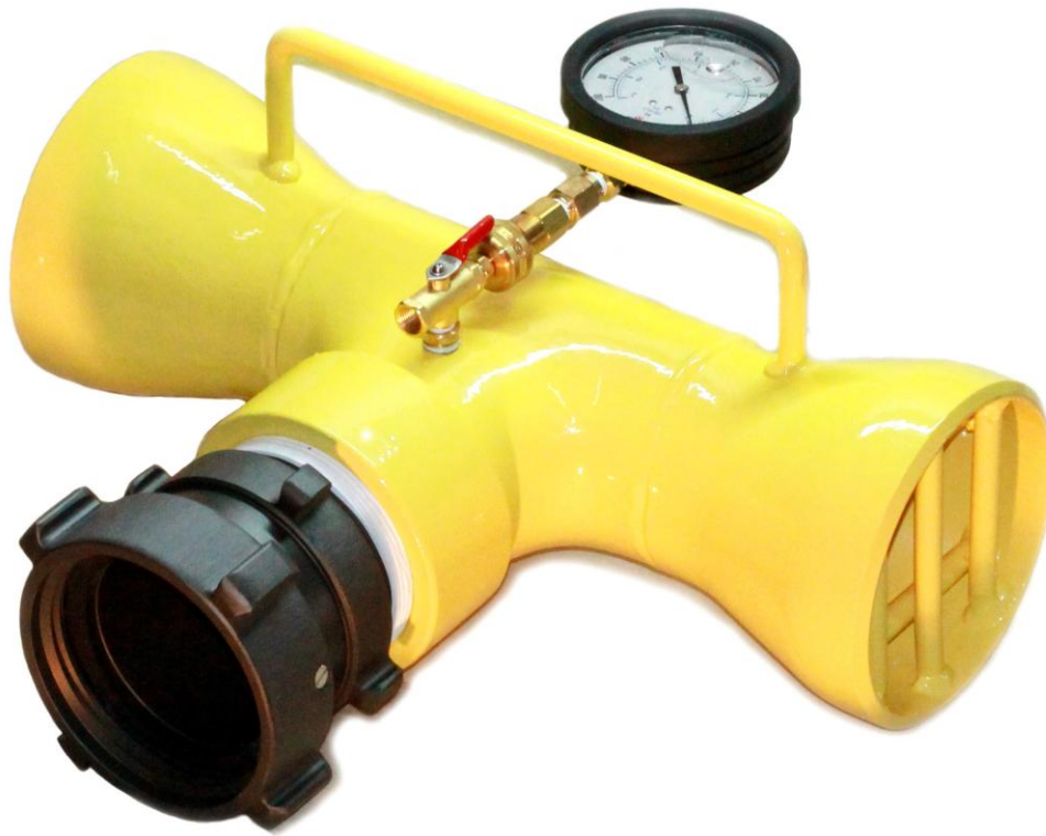
4" T Thrust Buster Diffuser with built in Pitot