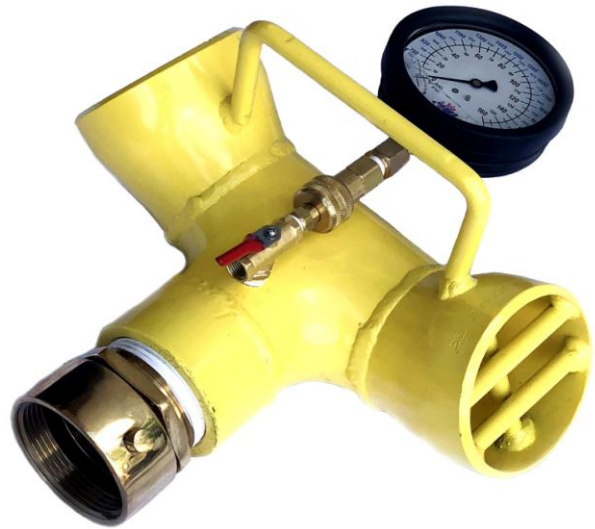
2-1/2" 30° T Swivel Hydrant Piezo Diffuser