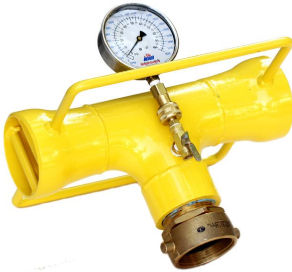
2-1/2" Straight T Diffuser with dual Handles