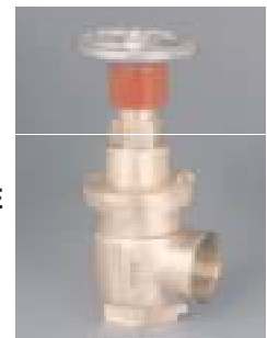
18-458 DOUBLE FEMALE