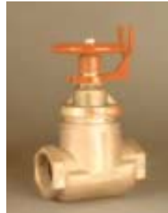
18-459 DOUBLE FEMALE

Maximum rated inlet pressure for each valve type regardless of size or model; to assure a maximum outlet pressure of 175 psi. Can still be safely hydrostatically leak tested to 300 psi for 1½" size and 400 psi for the 2½" size.