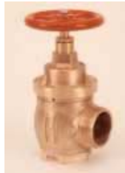
18-457 FEMALE NPT INLET X MALE